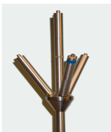
The acoustic sensor (4 high quality microphones)