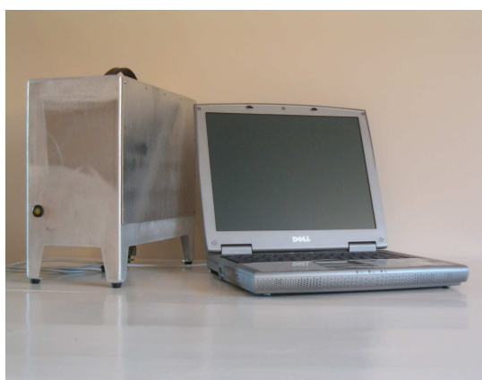
The SniPos processing unit, performing all calculations, and the laptop which may be used for presentation (connected via Ethernet).

The last 10 000 detected shots are stored within the processing unit for reporting of weapons activity over time.